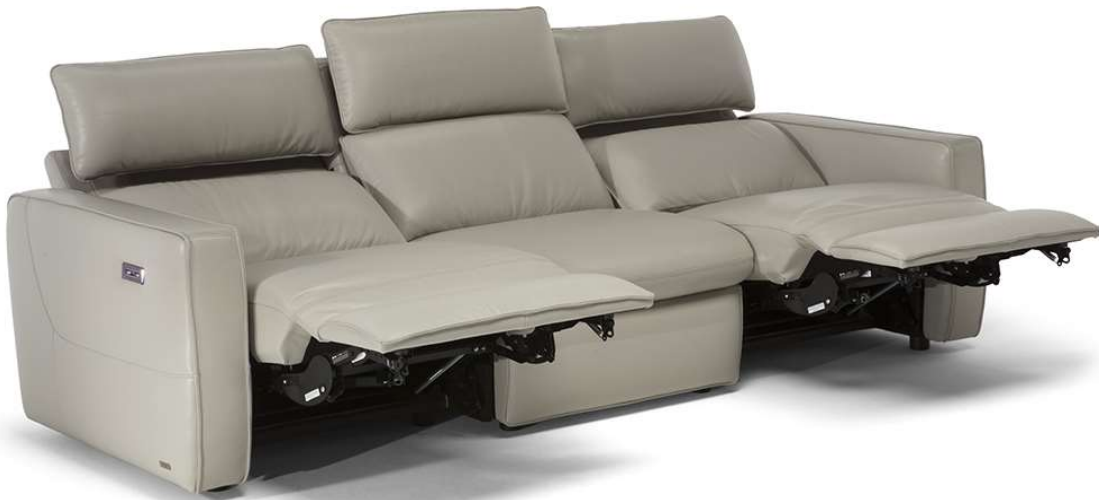
■ Vers. F50+291+F52