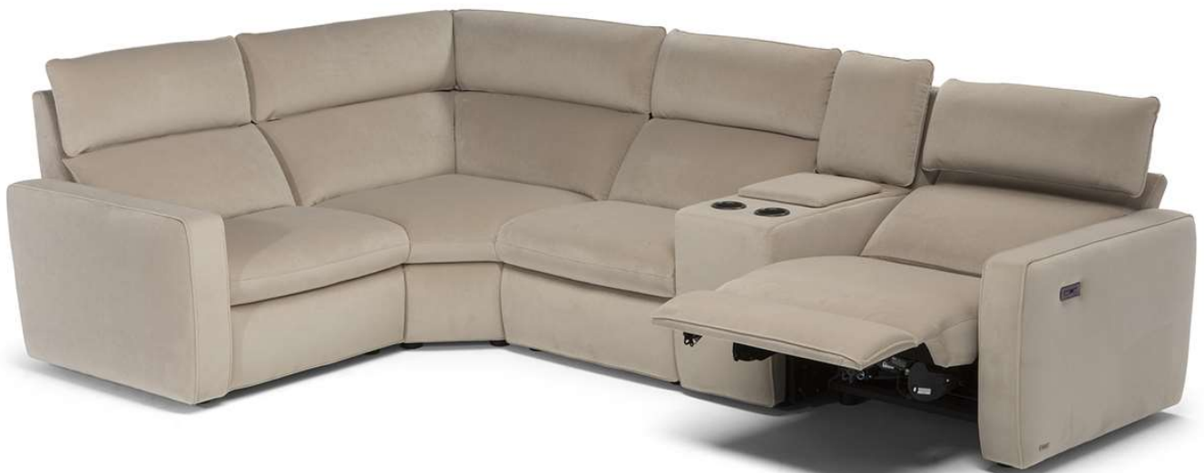
■ Vers. 272+011+291+323+F52