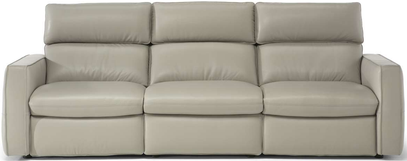
■ Vers. F50+291+F52